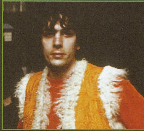
Syd Barrett tried to set us free.

Profits from the concert will be donated to the mental health charity SANE nominated by the Barrett family.